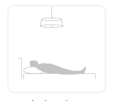
during sleep no light