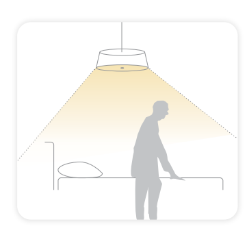
out of bed brighter light