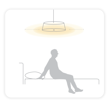
when sitting up soft light