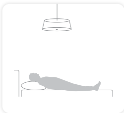
during sleep no light