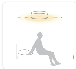
when sitting up soft light